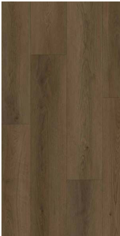
22703 Light Walnut