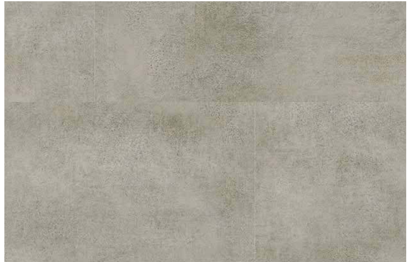
22721 Warm Cement