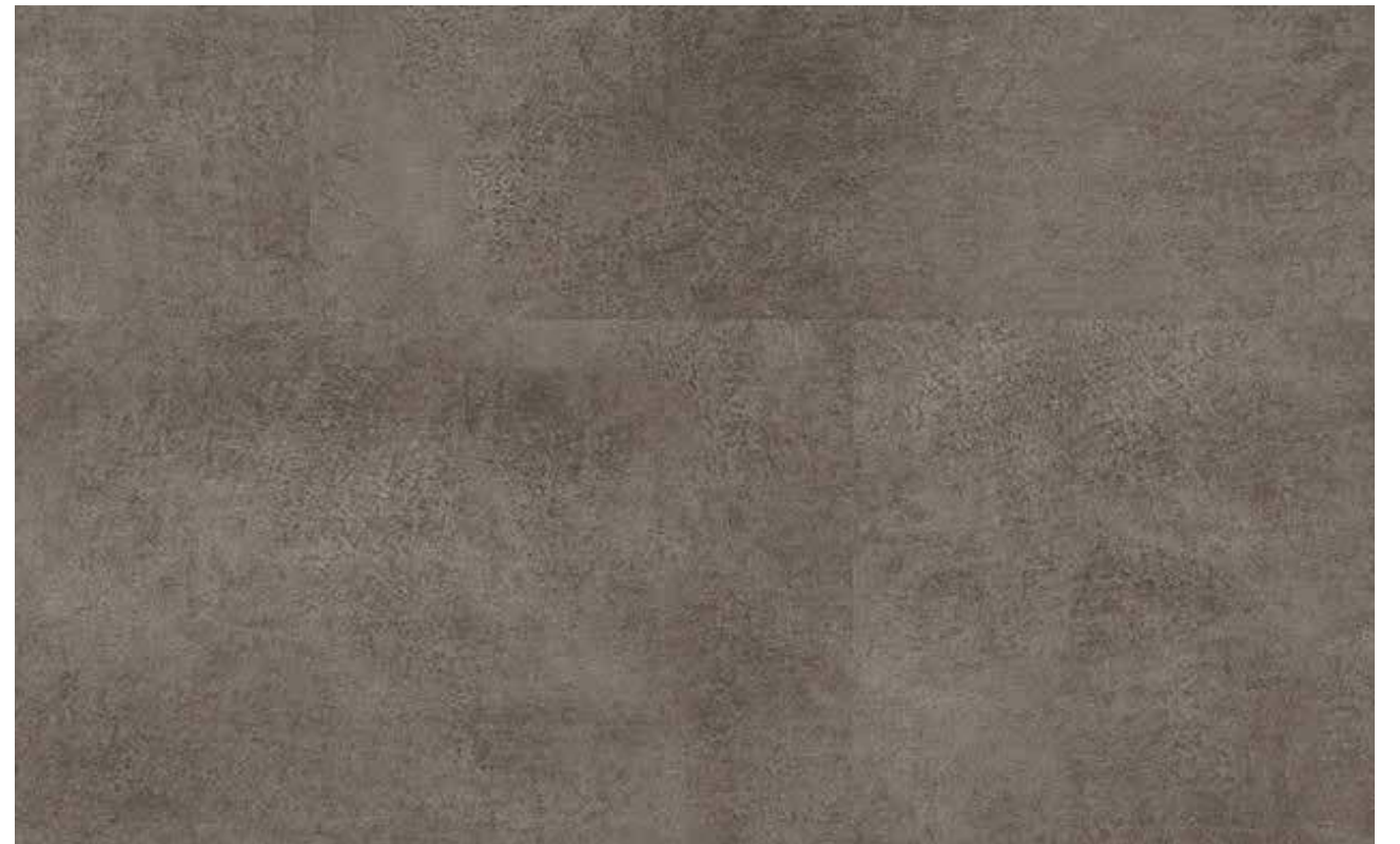
22722 Dark Concrete