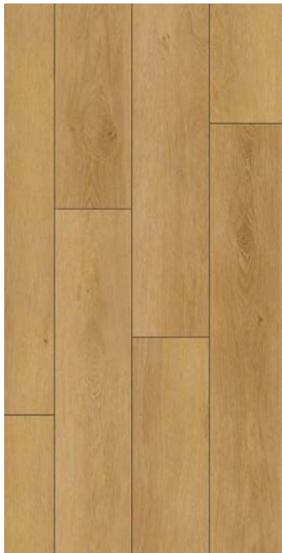
22704 Fresh Oak