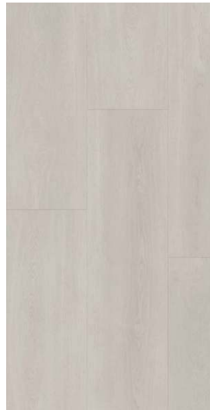
22705 Shore Oak