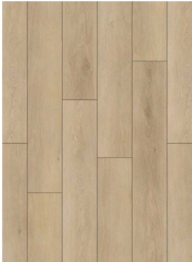
22702 Washed Wood