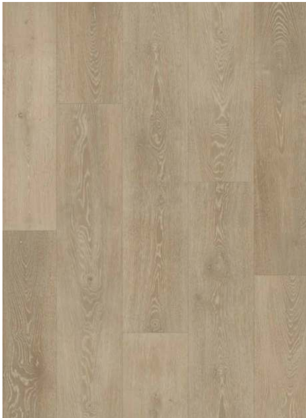
22701 Ice Oak